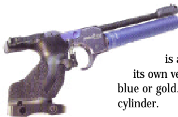
Hämmerli AP40 Air Pistol

The newest Hämmerli air pistol is the AP40. It is absolutely quiet and provides consistent shot delivery. All movable parts are manufactured from extremely light materials. The firing pin is positioned at the center of gravity of the pistol. The integral front sight has three sight widths. The trigger tongue is adjustable in length and rotates around its own vertical axis. This air pistol is available in blue or gold. It is delivered in a case with an extra cylinder.