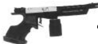
C55 Air Pistol

Feinwerkbau has been contacted by many top pistol shooters and asked to create an air pistol with an absorber similar to that on their air rifles. The engineers succeeded in modifying the absorber of the air rifle in a way that it could be integrated into the new air pistol Model P34. This new air pistol has a new rear sight which is infinitely variable from 1.5 - 4.8mm with extremely low sighting line. With the new interchangeable trigger block, the P34 is quite easy to service.