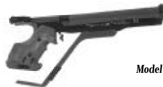
Model 103 Air Pistol

The Feinwerkbau model C55 is an improvement on the C5. It is a superb training device for the rapid fire shooter, either conventional or International. It is a rapid fire CO 2 air pistol that can also be used for normal precision firing. A single-shot magazine can be introduced from the right as well as from the left into the magazine recess so left-handed shooters can take advantage of this feature too. The trigger weight is adjustable from 200g to 600g. The C55 has the same grips as the P30 and is also a fun way to shoot air pistol silhouette.