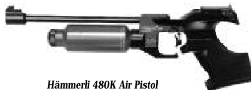
Hämmerli 480K Air Pistol

The Hämmerli 480K is the second generation of the 480 air pistols. It is lighter than the 480 which makes it an ideal air pistol for junior and female competitors. The short, detachable aluminum air cylinder brings the center of mass closer to the hand. Each fully charged cylinder will provide 180 shots. The 480K has black, adjustable synthetic grips. Walnut grips are optional. The 480K is now out of production but we have quite a few in stock at a very attractive price.