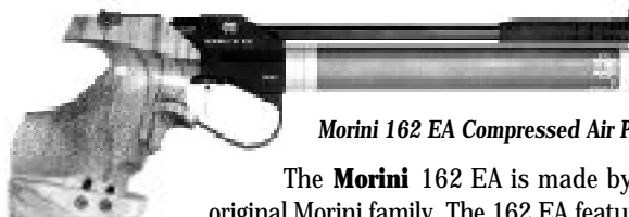
Morini 162 EA Compressed Air Pistol

Air guns, like smallbore rifles, vary in accuracy depending on ammunition brand, size and lot. Most air rifles and pistols should be able to shoot a group nearly the size of a pellet. For the past few years, Gunsmithing, Inc. has tested all air rifles and most air pistols sent to the shop for servicing. We are now offering this testing for shooters who want to examine the accuracy of their air guns with different pellets. Guns will be tested with H&N Finale Match and RWS R-10 pellets in all four sizes available. The test targets will be returned with the gun. Shooters will have the opportunity to purchase the pellets that tested best in their gun.