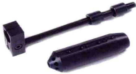
Compensator & Barrel weight - 70 g