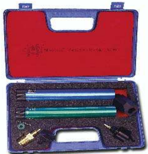
Air conversion kit for FWB CO2 pistols

compound and hardener providing a perfect hand to pistol grip shape - easy to apply and simple to profile