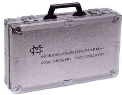
Aluminium carry case (2)

suitable for the 162 range of pistols and the 22M, 32M and 102E pistols with MORINI logo