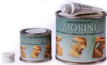
Morini compound (125ml / 750ml)

suitable for the 162 range of pistols and the 22M, 32M and 102E pistols with MORINI logo