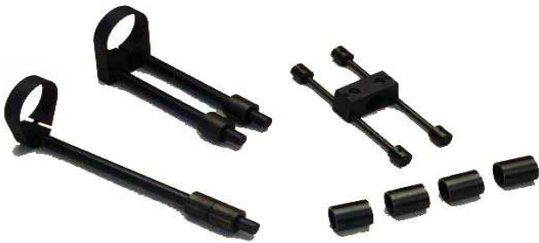
Several kind of barrel and cylinder weight