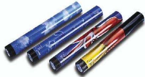
Special design cylinder

Special design air cylinder can be supplied with your national flag, club colour, team photo or artistic scene to order - please enquire