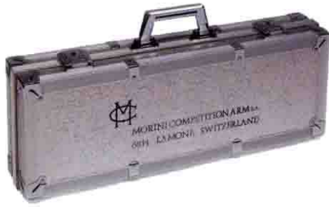
Aluminium carry case (1)